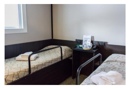
Standard Plus with window